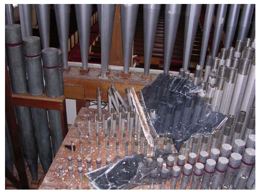
Leavell Katrina damage

instrument that could create the colors of all periods of music history. We also had to consider accompaniment of voice, both solo and choral. In this diminutive hall with seating for around 100, we had to create a rich, full palette without overwhelming the performer or listener. Tonally, the voicing is in a very clean, unforced style. There is crispness to registrations that will promote clean, articulate playing.