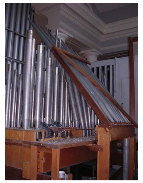
Leavell Katrina damage

exceed the organ's replacement cost. The insurance company did not understand that if you replace the chests, swell box, some pipework, the winding system, and the console with new materials, the organ would cease to be Opus 1468. While we fought for funds for restoration, the client and our firm resolved that either the Skinner would be unaltered and restored without change, or if changes were required, that the resources would be folded into a new instrument. As negotiations concluded, funds available for the Skinner were not sufficient for a true restoration.