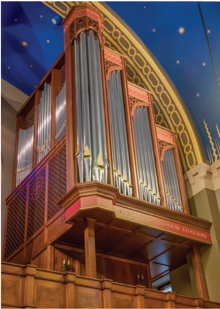
Carved and gilded into the organ case: Ad gloriam Dei et sanctificationem fidelium •

16' Violone, only sharing the two lowest octaves with the manual. In its home division, it functions as a secondary foundational register.