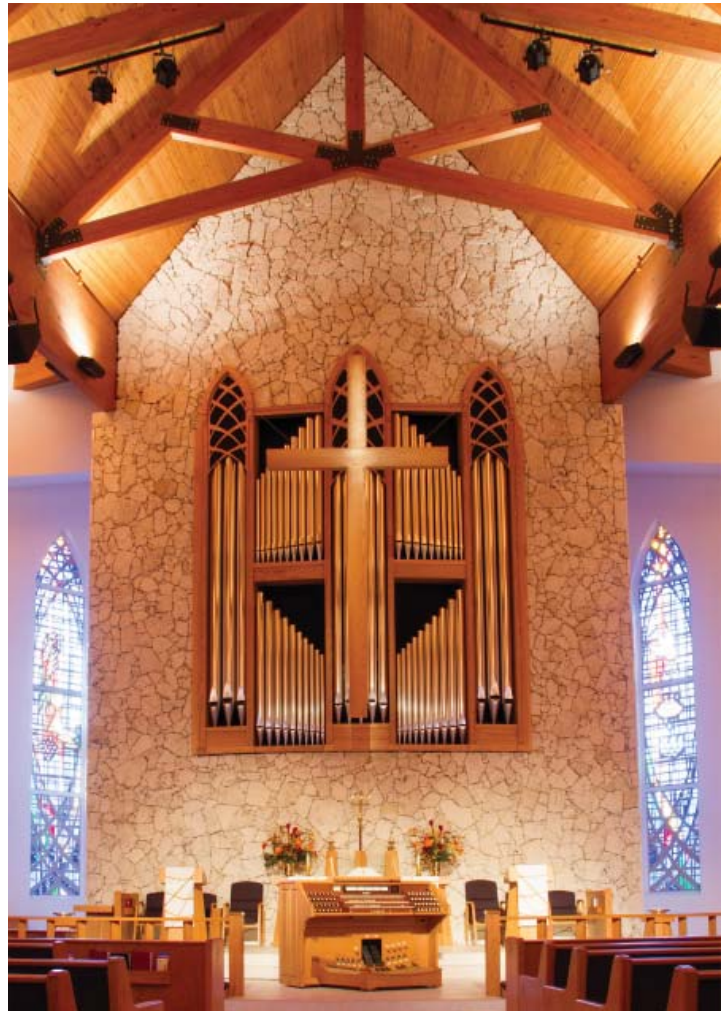
View of sanctuary, new pipe organ, and console

A constant challenge in organ building is having enough space in width, depth and height. In this instance the internal chamber had "too much of a good thing" in terms of height. The loft inside the organ chamber went well over 25 feet above the top of the frontal opening, creating a significant tone trap that had to be addressed. The solution was to continue the Swell