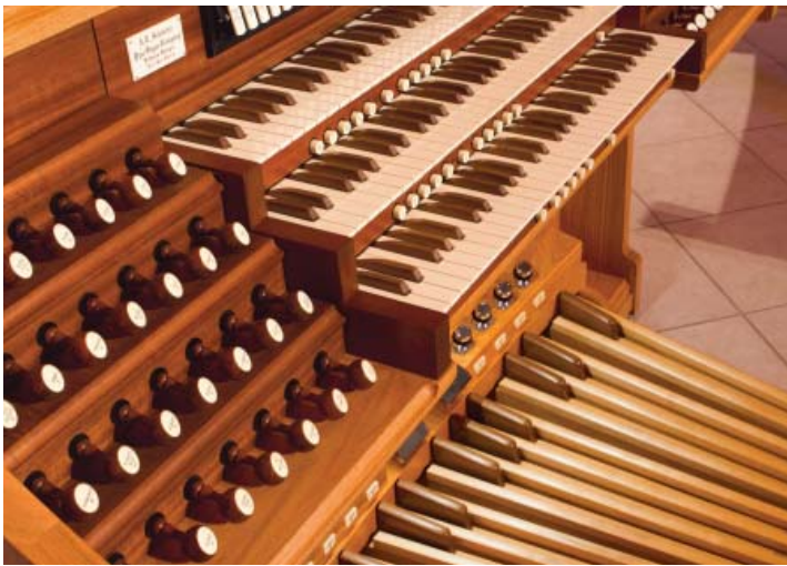
Terraced console with oblique, turned pau ferro drawknobs