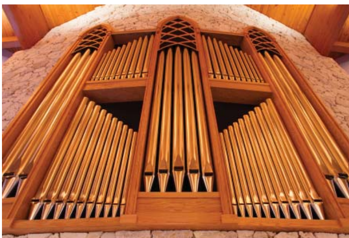
Looking up at the gentle arc of the facade pipes and casework

pedal towers are evocative of the concrete lace that holds the stained glass within the windows of the church. The polished surfaces of the organ façade pipes play on light in such a way that the façade takes on natural soft, even hues, melding with the church interior. The pipework in the organ façade contains the independent 16' Principal, and bass registers of the 8' Principal and the 4' Choral Bass.