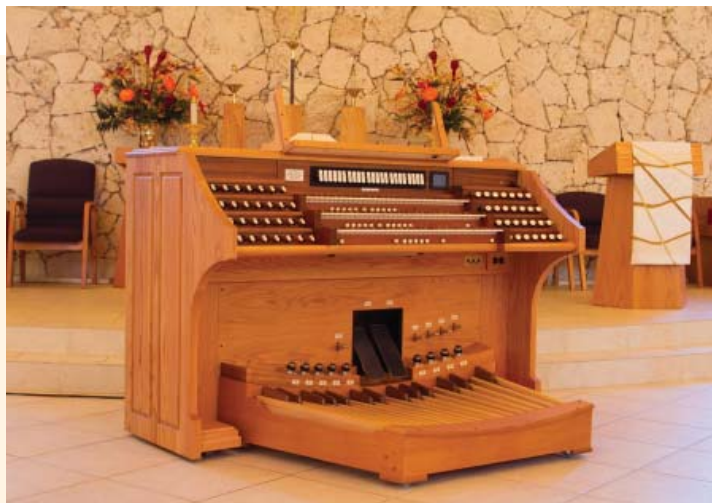
The console has built-in casters for mobility