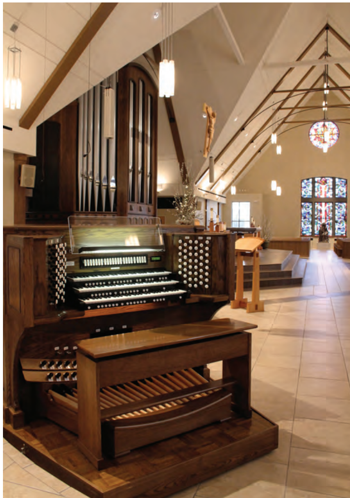
Console on movable platform

When I was brought into the project, the basic layout of the sanctuary had already been formed and we lacked a space that allowed