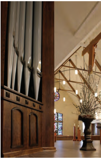
Closeup of organ case and façade pipes