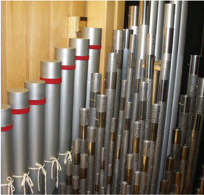
Pipes inside the Swell chamber