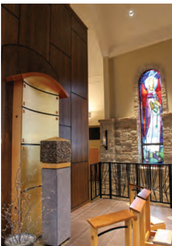
The rear panels of the organ casework provide the backdrop for the baldacchino in the prayer chapel