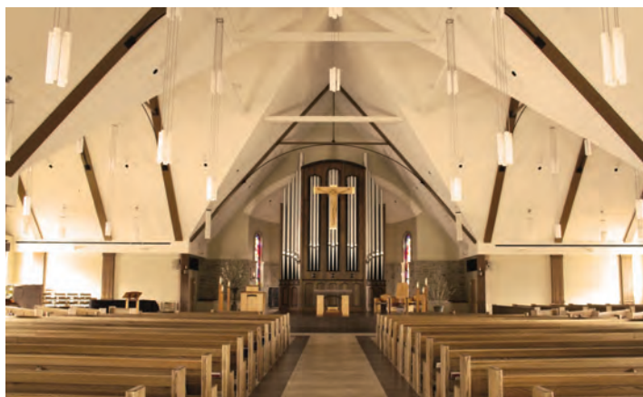
Sanctuary at IHM featuring pipe organ as backdrop to the cross

consideration for an organ chamber location. The only possibility was to incorporate a free-standing organ case design. The challenge was to find sufficient space that would work physically and tonally for the organ. As we studied the building plans to find a location, the sole workable area was on the central