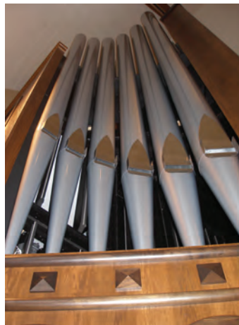
Closeup of casework details and façade pipes arranged in an arc

The 16' Trombone and 16' Basson-Hautbois provide the reed foundation for this instrument. The 16' Trombone in the Pedal division is available as a manual extension to provide a dynamic solo reed. This stop is eight inches in scale at CCC and is on a moderately high wind pressure. It provides a rich, vibrant voice in the favorable acoustics of the room and can work equally well as a solo voice or logi-