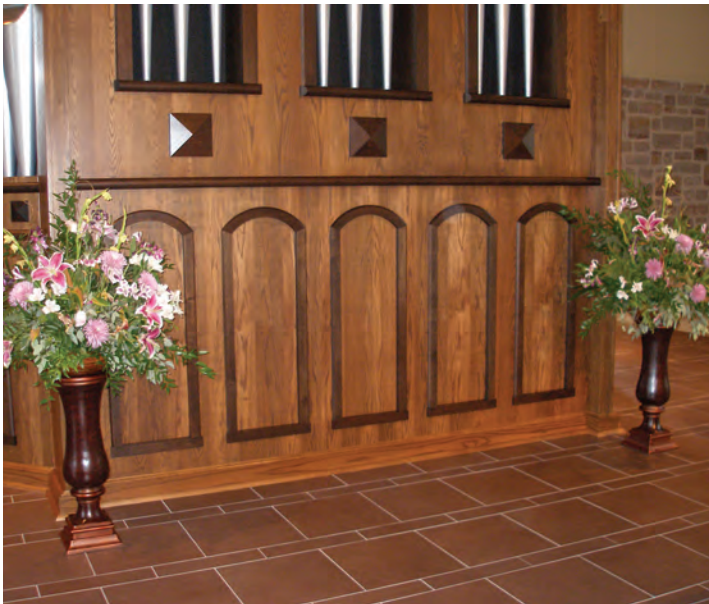
Closeup of organ casework details