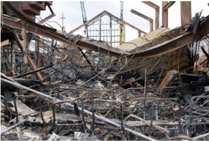
Hendricks Avenue Baptist Church the morning after the fire

on their front and also on the side openings into the center Great and Pedal division. These side openings provide a coalescence and focus for the enclosed resources into the central axis of the instrument.