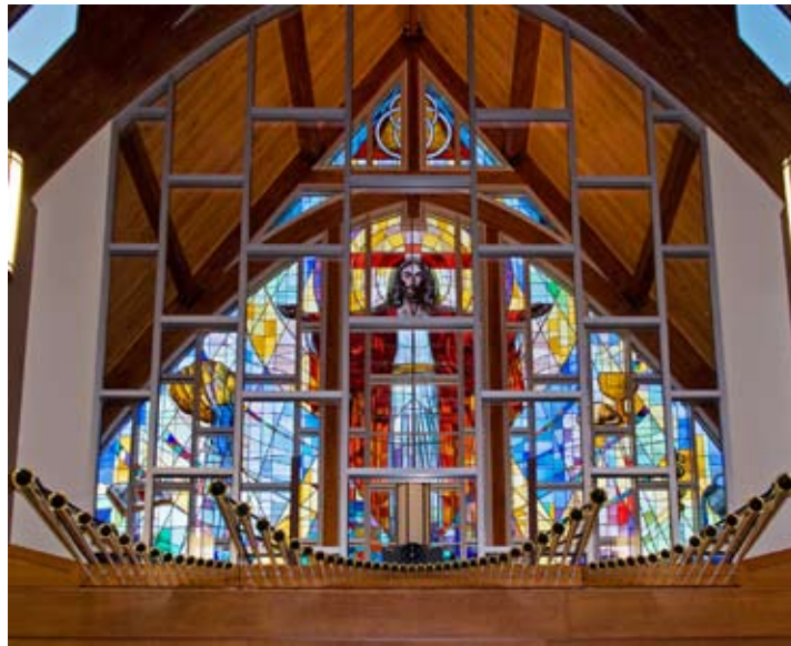
Antiphonal organ Trompette En Chamade