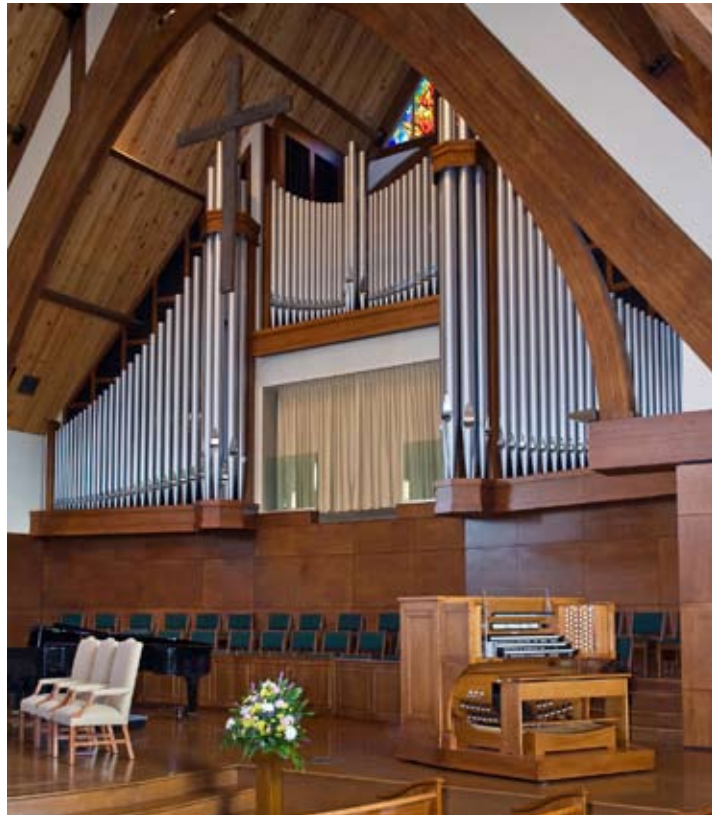
Chancel organ side view